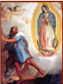
St. Juan Diego being stopped by the Virgin of Guadalupe

Juan Diego displayed great strength and patience before the ensuing difficulties and contradictions. At one point, the bishop asked for a sign and the Virgin Mary asked Juan Diego to go back to Tepeyac so that she could give him the sign that had been requested.