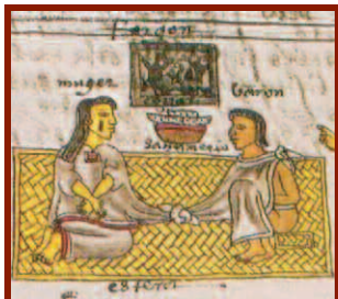
Representation of the Indian wedding depicting the knot made with the bride’s “ huipil ” and the groom’s “ tilma .”

The image on the tilma shows the Virgin Mother as a mestiza (a woman of mixed race), wrapped in the sun with the moon at her feet, her robe studded with stars. Her message and will is the spreading of the love of God and that is why she asked for a temple, to offer His love to persons of every lineage who trust in Her.