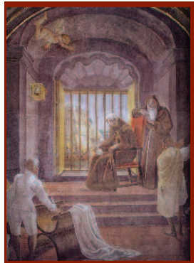
St. Juan Diego before Zumárraga

On Saturday, December 9, 1531, Juan Diego was on his way to Tlatelolco to attend catechism when the Mother of God appeared to him. She asked him to be her messenger so that a sacred little house, a temple, could be built in the valley of Tepeyac where she could offer there all her love in the form of her Son, Jesus Christ. She said this needed to be approved by the bishop, Fray Juan de Zumárraga.