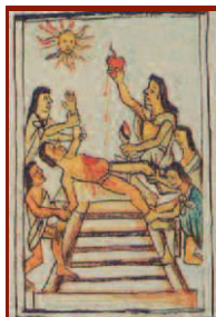
Human sacrifice: Offering of the heart and blood to the sun god.

Lord, consists of the apparitions of Our Lady of Guadalupe to an Indian named Juan Diego Cuauhtlatoatzin (which means: Eagle able to speak ), which took place between December 9 and 12, 1531, on the hill or Tepeyac north of Mexico City.