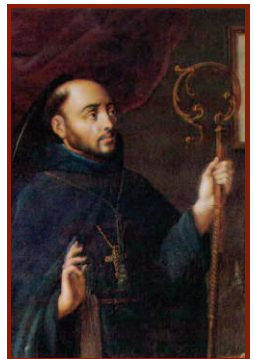
Fray Juan de Zumárraga, first bishop of Mexico.

The friars were indeed very worried because while they were trying to defend the Indians from the mistreatment by the Spaniards, they were also trying to stop arrogance, hatred, and greed from destroying the Spanish community itself. The Primera Audiencia (First Audience), a civil governmental agency at the time, was a most corrupt institution. Thefts, violations, and unjust behavior plagued and seriously affected both the natives and some of the Spaniards who were trying to correct the situation. The Spanish missionaries suffered atrocities at the hands of their Catholic compatriots, who allowed their hearts to be tempted by incredible cruelty, even to the point of attempting to murder the bishop of Mexico City, Fray Juan de Zumárraga. The bishop was forced to excommunicate the members of the First Audience, damaging their reputation in México City. It was truly such an intensely complex time that Bishop Zumárraga wrote to the king while imploring God's help: "If God does not intervene to provide an instant remedy, this land is on the verge of being lost forever..."