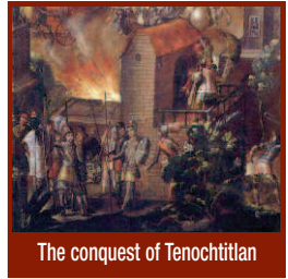
The conquest of Tenochtitlan