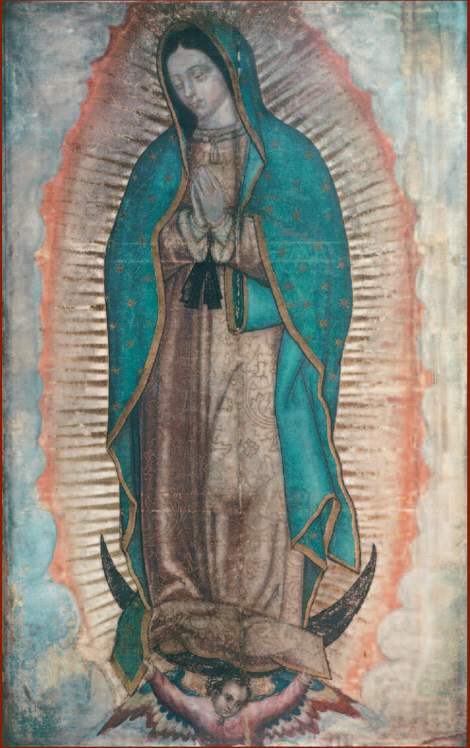
St. Juan Diego's "tilma" showing the image of the Virgin of Guadalupe.