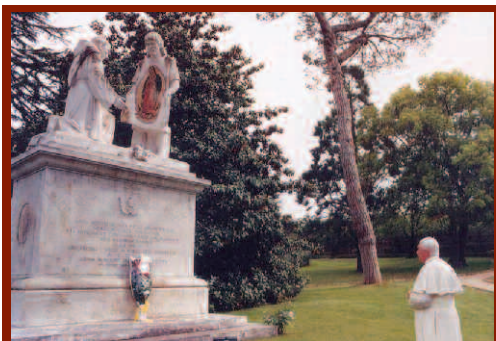
Pope Benedict XVI before a statue of St. Juan Diego, who is showing his “tilma” with the image of the Virgin to Bishop Juan de Zumárraga.

Consequently, not only in Central and South America, but in North America as well, the Virgin of Guadalupe is venerated as Queen of all America.” 2