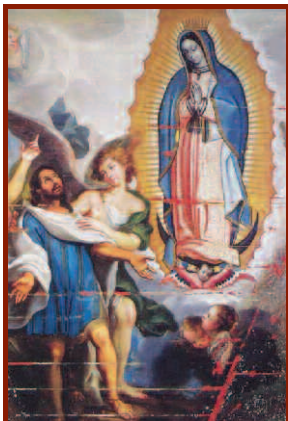
St. Juan Diego before the Virgin of Guadalupe.

God intervenes by means of his own Mother, Our Lady of Guadalupe, who is sent by the Father, through the Holy Spirit, to manifest her Son, Jesus Christ, and to allow every human being to become a participating part of Him. She is the first disciple and missionary who manifests and delivers to us the message of salvation. At the same time, she forms disciples and missionaries who can bear witness, at the expense of their own lives, to their immense joy upon encountering the love of Jesus Christ through his Mother and our Mother.