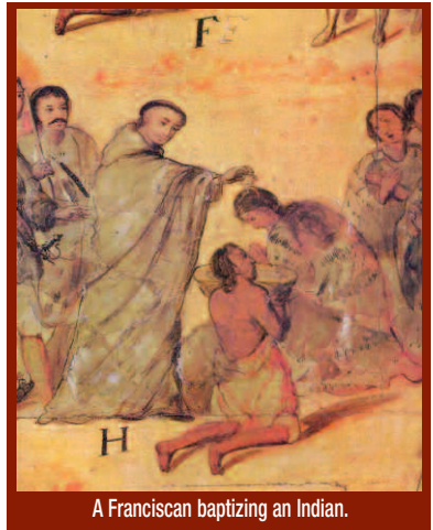
A Franciscan baptizing an Indian.

Shortly after the apparition of the Virgin of Guadalupe, conversions began occurring at an astounding rate. The missionaries could not believe what they were witnessing; they were startled and overwhelmed. The Indians were coming from everywhere, from far away lands asking for the sacraments. Fray Jerónimo de Mendieta said: "As they were being baptized, many of them received the sacrament with tears in their eyes. Who would dare say that they came without faith? It was hard for them to come from such far away places when no one was compelling them to do so to receive the sacrament of baptism. In 1539, only eight years after the apparition, almost nine million Indians had converted. As far as