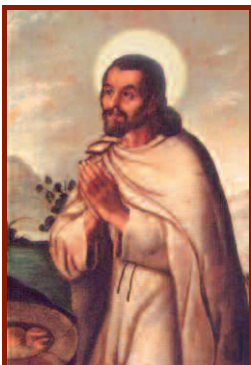
St. Juan Diego Cuauhtlatoatzin ("Speaking Eagle")

And God intervened through the being He loves the most, His own Mother, who chooses a simple and humble Indian to be her faithful messenger, her completely trustworthy intercessor: Juan Diego Cuauhtlatoatzin.